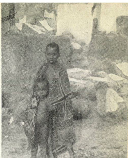
These two children were buried beneath the ruins of this house during a recent storm. Messengers rushed to the Holy Child compound in the middle of the night for help.