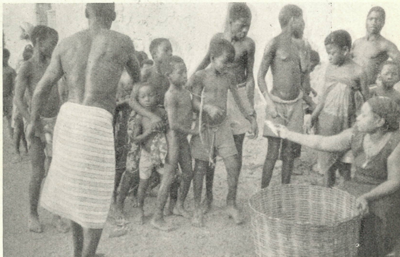
Distributing surplus bananas.