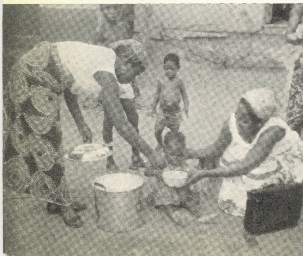
A favorite dish provided by Takoradi students: Rice cooked in milk and sugar.